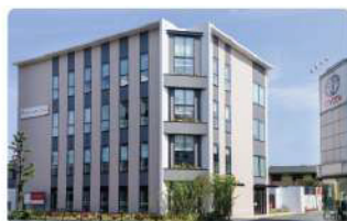
Exterior view of building from the Kanjo Hachigo (Ring Road B) expressway heading toward Nerima