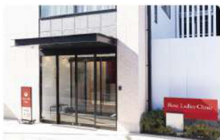
First floor clinic entrance